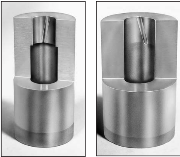
Dayton's slug control method is available on all matrixes: tapered and counterbored.

The advantage of Dayton's Slug Control system over other methods is that it is guaranteed .